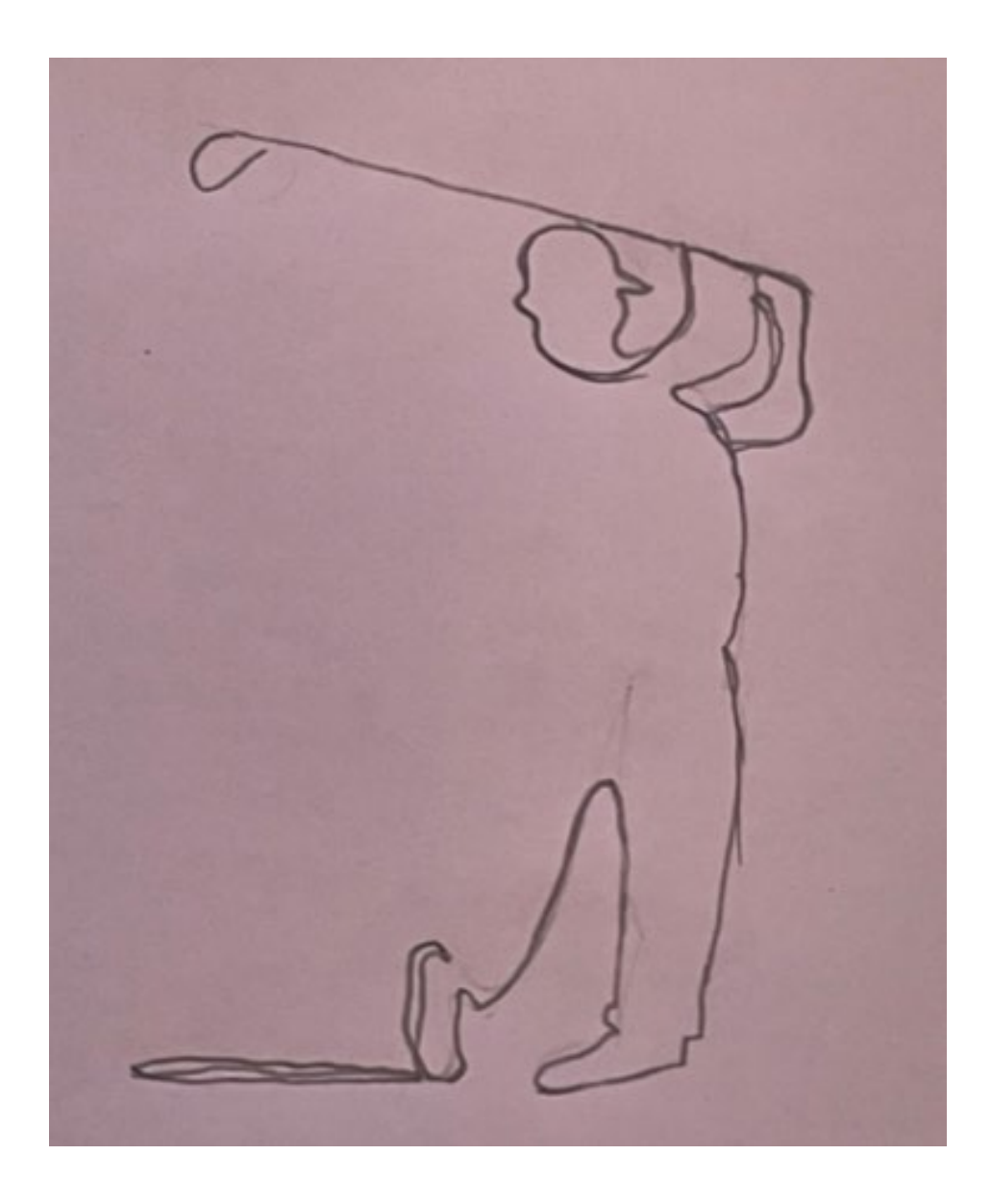
Exhibit A: Draft of silouette golfer sculpture