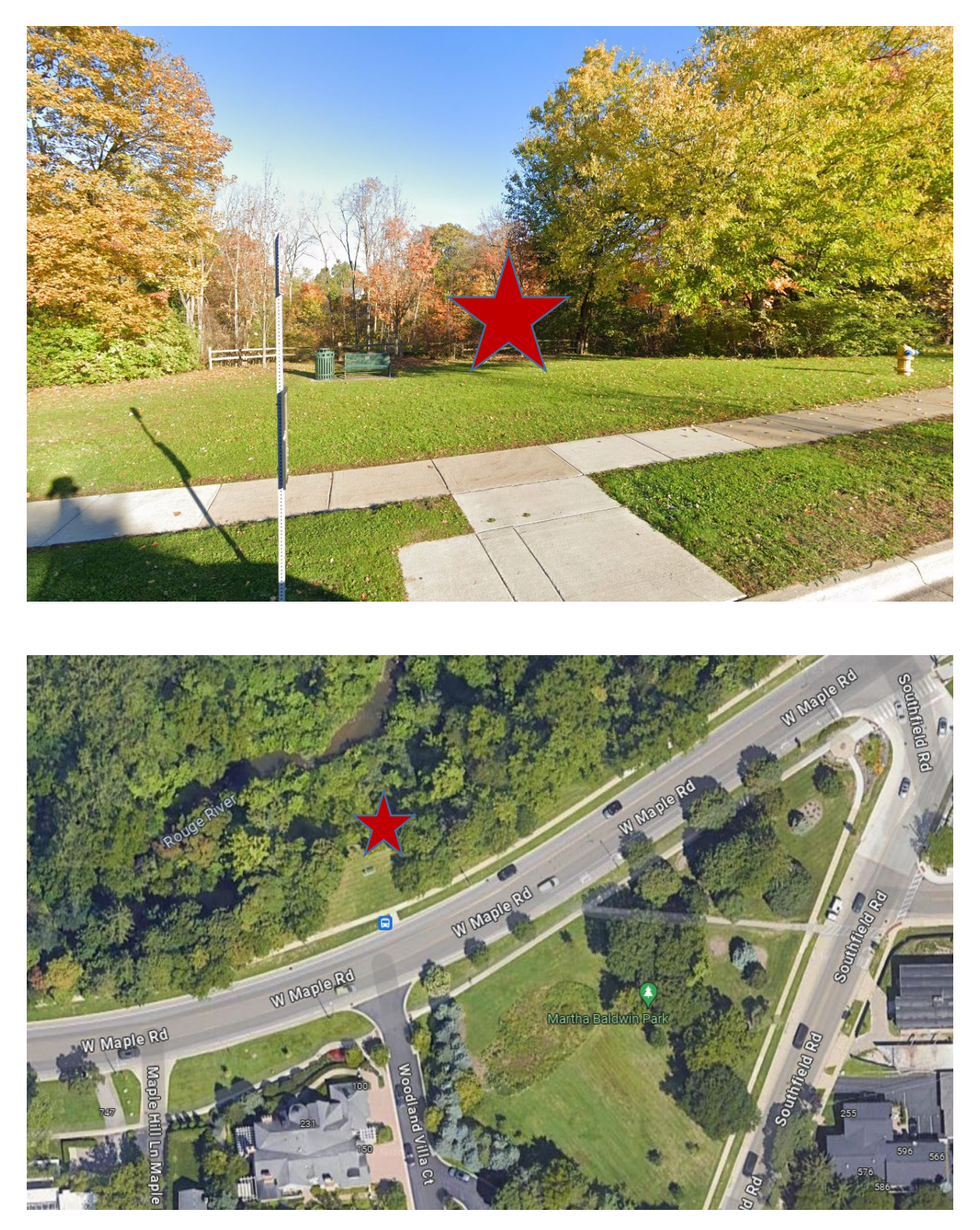
Exhibit A – W. Maple